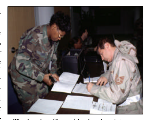
The legal staff provides legal assistance to deploying members to maximize the readiness of the force.

The legal support staff is integrated within each phase of the combat support process and provides legal services to maximize readiness. Legal services are provided at each level of command and are configured to directly or indirectly support the operational readiness of Air Force members and its activities. The contributions of the legal support staff to operational readiness extend from the legal readiness of individual airmen to the legal issues encountered at the strategic level. Commanders should fully integrate legal support within the combat support process to allow the legal support staff to prevent or identify and then mitigate the adverse effects of legal issues. Legal support within the combat support process