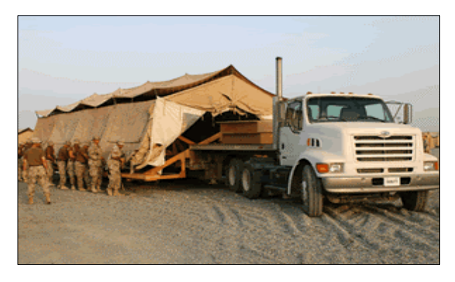
The legal support staff resolves legal issues that arise during redeployment to protect US interests after forces depart a forward operating location.