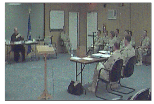
Expeditionary judiciary services ensure the fair and prompt administration of justice wherever the Air Force operates.

under the UCMJ or when other circumstances require judge advocates to represent the government's or Air Force member's interests in judicial, nonjudicial, or administrative proceedings. The legal support staff assigned to the Air Force Judiciary should be prepared to provide expeditionary judiciary services wherever the Air Force operates. The legal support staff in this category consists of military judges, circuit trial and defense counsel, area defense counsel, and court reporters. Each unique capability within this category independently offers a distinct legal skill set that is designed to ensure justice is fair and impartial.