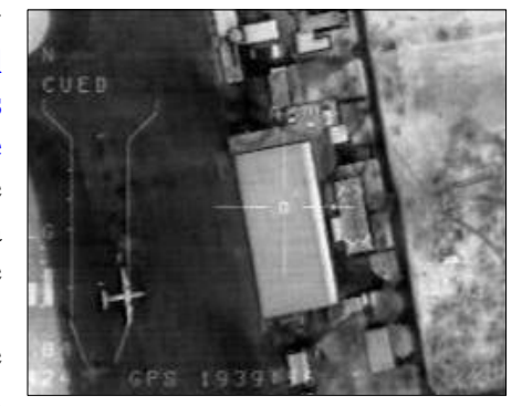
The legal support staff provides legal advice to lawfully engage targets during armed conflict.

international law and domestic law and policy on military operations. Judge advocates determine the existing legal environment and the laws that govern combat operations and seek to ensure all operations are consistent with the law and national policy. Legal advice is tailored to the requirements of each mission and is crafted to support a commander's course of action, if possible, or will provide recommendations on lawful alternative courses of action. Judge advocates understand and advise commanders on the limitations and exigencies imposed by international and domestic law and national policy and how both the law and policy affect operations at their level.