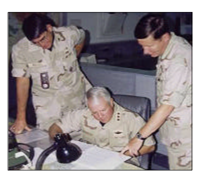
Judge advocates advise senior commanders, in joint and combined environments, on the legal aspects of planning

Air Force legal support may be integrated at various levels within joint organizations and may serve on joint legal support staffs dedicated to support a JFC or JFACC, or the joint air and space operations center (JAOC). The size, amount, and configuration of legal support will vary with each operation but a single legal activity may support multiple functions or commanders designated to serve in various roles. In large operations, a separate legal support staff may be dedicated to independently support a JFC, JFACC, and the JAOC. contrast, in small operations a single joint legal support staff may collectively support all the above functions. In all cases, open communication and close coordination among all legal support staff throughout the joint organization are essential to ensure consistent legal advice is provided to commanders and their staffs.